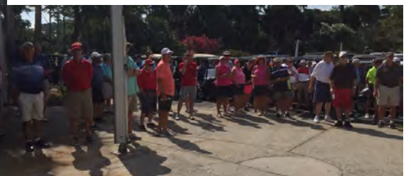
Waiting for "Gentlemen, Start Your Engines".