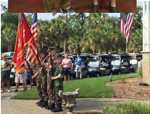
Above: Young Marines 'Present Arms' for the Pledge of Allegiance.