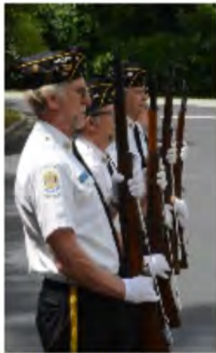
American Legion Post 71 Ceremonial Corps