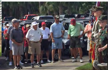
Golfers listening to 'The Plan of the Day'.