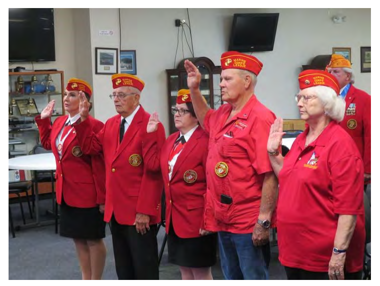
Det. 803 held their Installation in April.