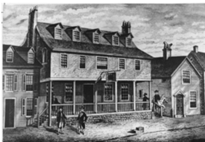
An artist's sketch of Tun Tavern, the birthplace of the United States Marine Corps.

One of Earliest Known Uses of "Marines" by Continental Congress On October 5, 1775, the Second Continental Congress held a meeting in Philadelphia, Pennsylvania, in which they used the word "Marines" on one of the earliest known occasions. The word was used in direction to General George Washington when it directed him to secure two vessels on "Continental risk and pay", and to give orders for the "proper encouragement to the Marines and seamen" to serve on the two armed ships.